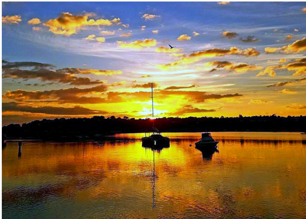
ONE OF THE SPECTACULAR SUNRISES IN MERIMBULA THROUGH MAY